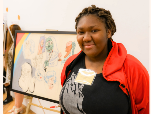
"This event was empowering and healing for individuals and communities." – Orpheum attendee